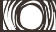
Artificial and Seminatural Trees